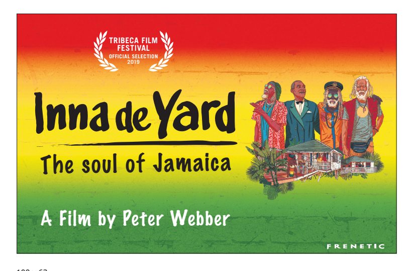
100 \times 63 \, \text{mm}