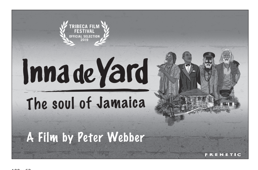
100 \times 63 \, \text{mm}