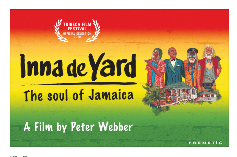
100 \times 63 \, \text{mm}